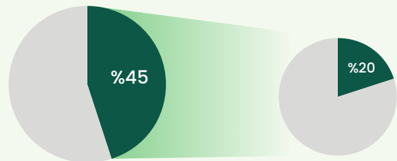
Percent of Americans with a will or estate plan